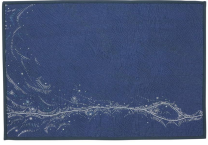
Unstratified Glacial Drift